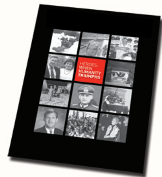
above: exhibition booklet, When Humanity Triumphs